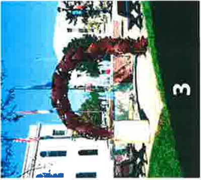
Title: Oak Leaf Arch Artist: Jim Gallucci Hometown: Greensboro, NC Material: Steel and Concrete $10,000