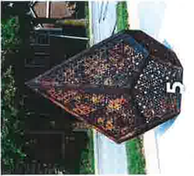
Title: Rusted Spire Artist: Christopher Knight Hometown: Chicago, IL Material: 18 Pound Closed Cell Sign Foam $6,500 in Steel