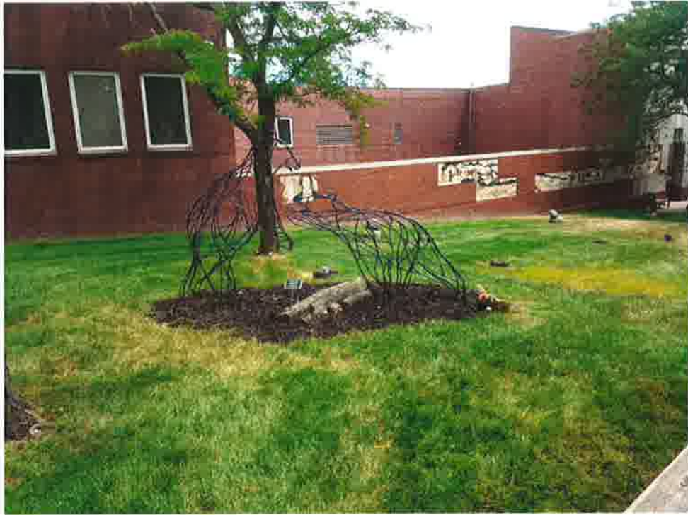
Out of the Woods by Leslie Tharpe $6,500 Negotiable