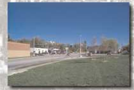
EXISTING MILL STREET